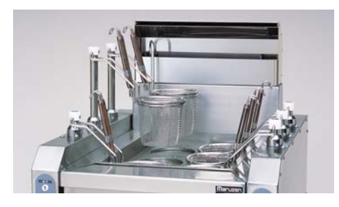
Supply hot water to utilize exhaust heat Enabling to continue cooking

Light up 5 seconds before finishing and sound buzzer when completed