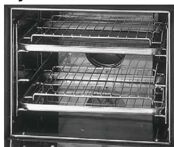
Inside of oven fully made of stainless steel and durable.

The fan is stopped and the fire turns off automatically, when you open the oven. Besides, in addition to pilot safety shut off device and overheating prevention device, the 2 nd overheating prevention device was equipped. Safety was more improved.